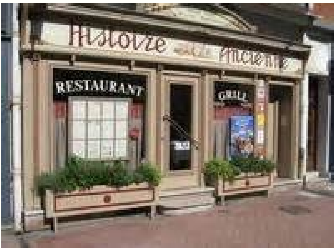
Guide michelin restaurants.